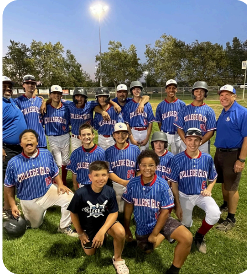
College Glen LL Fall Ball Registration opens August 1!

The entire College Glen family is so proud of the boys for their winning streaks and competitive losses.